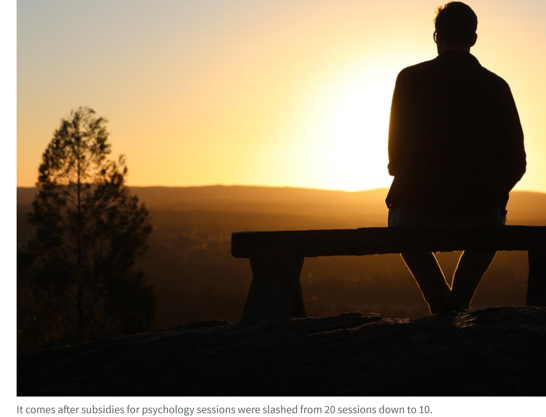
It comes after subsidies for psychology sessions were slashed from 20 sessions down to 10.

"The message I've been getting is the government understands it's very complex and don't want to be putting in any measures quickly that have perverse outcomes," she said.