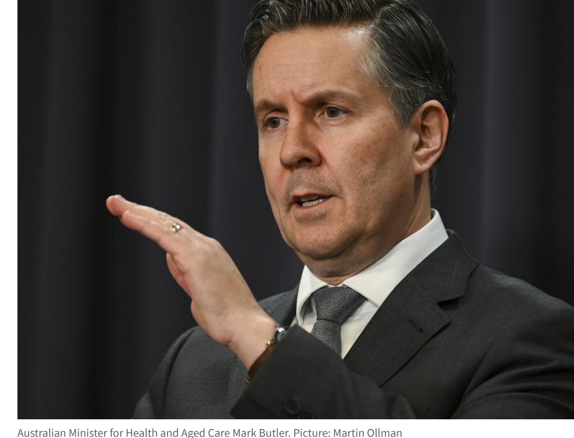
Australian Minister for Health and Aged Care Mark Butler.

"We're really waiting to see where the priorities lie," he said.